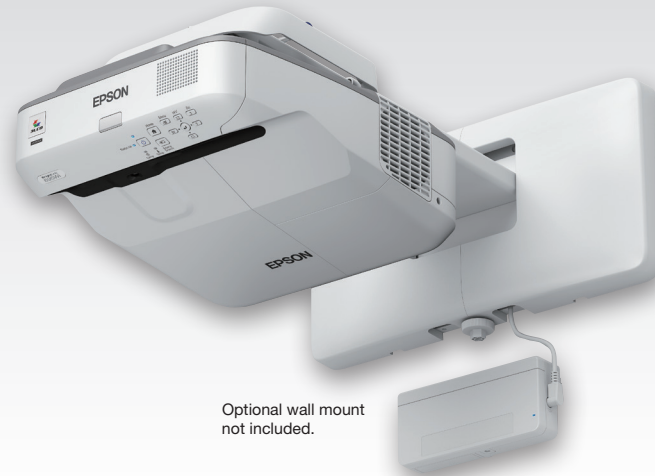
Optional wall mount not included.